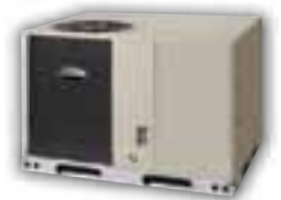
Large Packaged Air Conditioner & Heat Pump