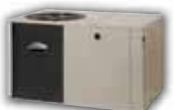
Small Packaged Air Conditioner & Heat Pump