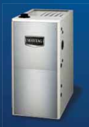
M1200 iQ Drive® Modulating Gas Furnaces