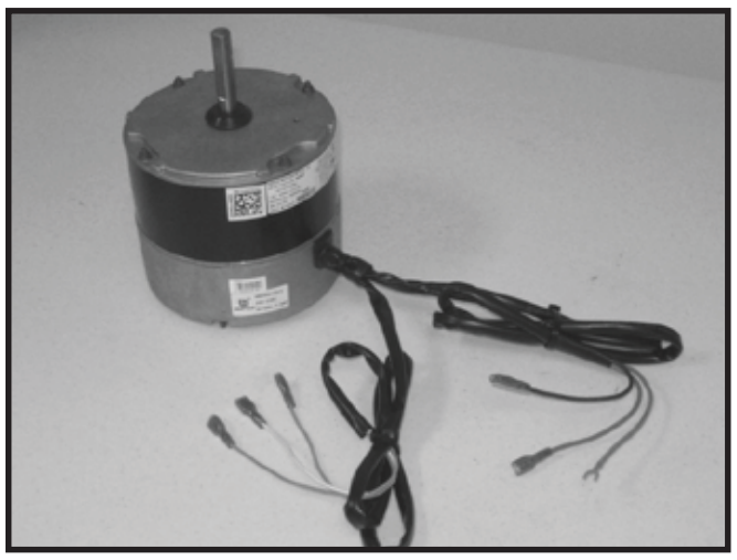
Figure 2. Replacement Motor (P/N's 1006722 or 1006723)