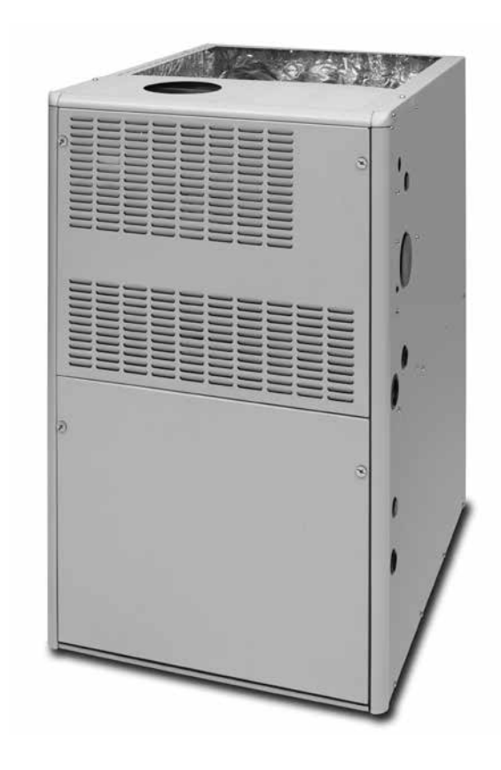
UPFLOW / HORIZONTAL FURNACE