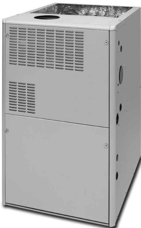
UPFLOW / HORIZONTAL FURNACE

This product complies with SJVAPCD 4905 and SCAQMD 1111 with NO x levels below 14 ng/J when operated on natural gas.