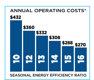
* Annual costs based on 36,000 Btu unit, 1500 cooling load hours, and .08/kwh. Actual costs may vary depending on climate conditions, energy rates and patterns of usage.

Westinghouse two-stage, variable-speed split system products are energy-efficient, environmentally responsible products. Look for the ecoLogic<sup>®</sup> seal.