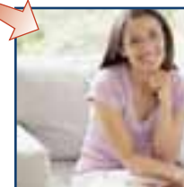
Living Room Zone