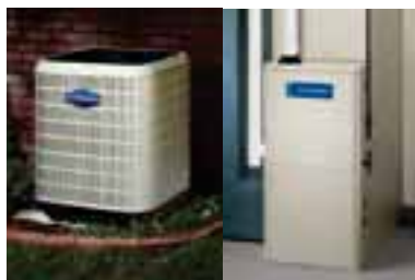
Heating and Cooling System