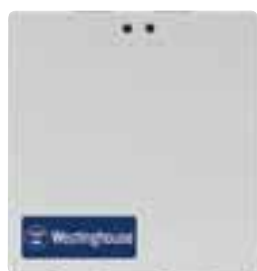
Zone Control Panel