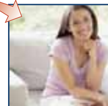
Living Room Zone