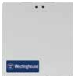
Zone Control Panel