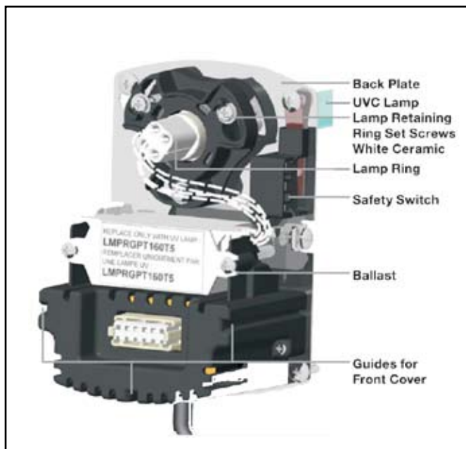
Figure 2. -UV-C Germicidal Light with Front Cover Removed