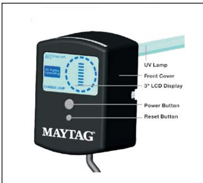
Figure 1. -UV-C Germicidal Light