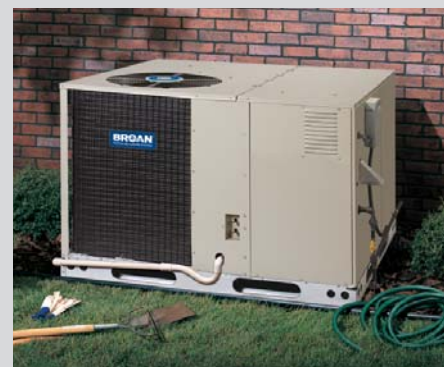
*3-5 Tons Only