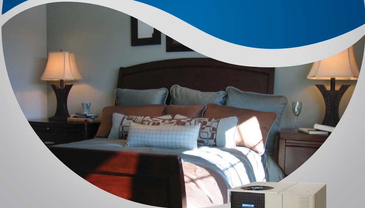
14 SEER R-410A iHYBRID™ PACKAGED SYSTEM

Innovation, dependability and total comfort