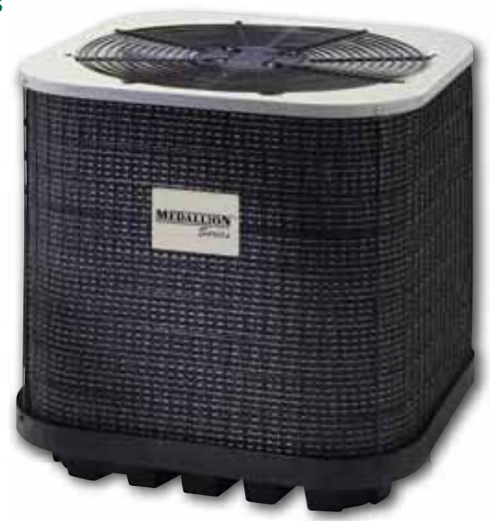
Model NT4(Q,B)D Heat Pump