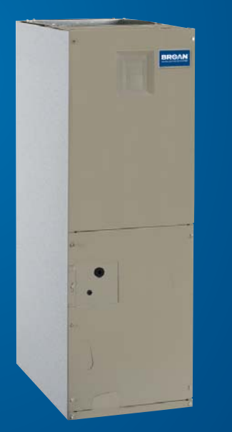
13-14 SEER Air Handler