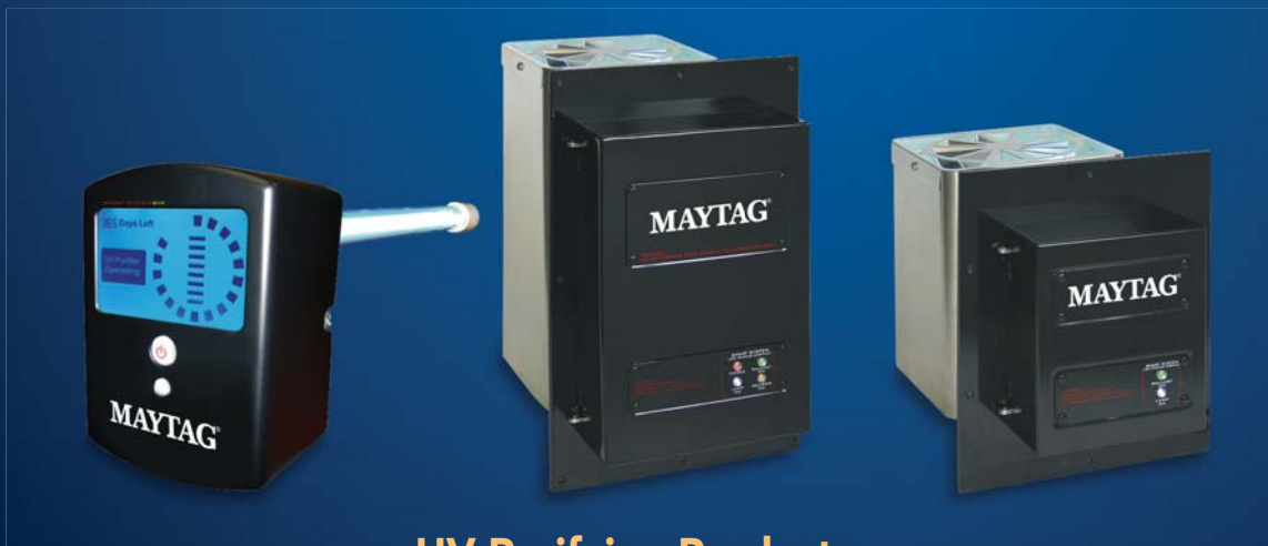
UV Purifying Products