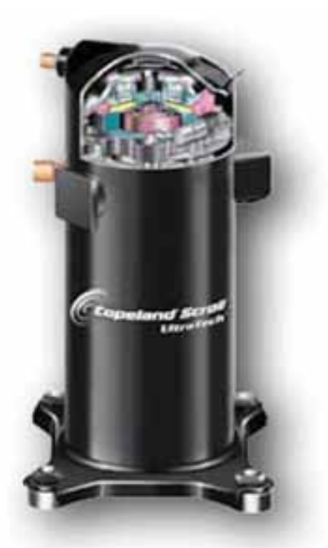
The Ultra-Tech Copeland Scroll<sup>®</sup> Compressor works with the variable-speed indoor section to decrease humidity levels and reduce hot and cold spots

Maytag<sup>*</sup> air conditioners and heat pumps include additional features for extra quiet-performance, such as swept-wing fan blades, sound reducing bases, and compressor blankets.