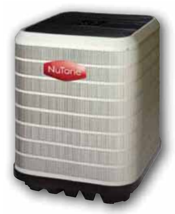
NuTone up to 16 SEER air conditioners and heat pumps utilize a variable-speed indoor unit.

A NuTone variable-speed system automatically maintains its programmed level of air flow regardless of dynamic changes in static pressure. Static pressure will change with a dirty air filter, zoning changes and obstructed supply registers as an example. Better indoor air quality is achieved quietly and inexpensively by setting the motor to run continuously at reduced airflow levels between cooling cycles. The NuTone variable-speed system also operates quieter than conventional motors, while reducing temperature swings, indoor moisture, and hot spots.