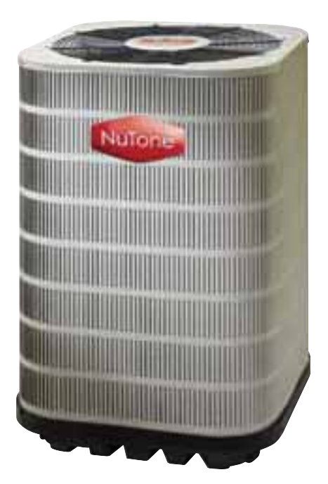
NuTone air conditioners and heat pumps can utilize a variable-speed indoor unit.

A NuTone variable-speed system automatically maintains its programmed level of air flow regardless of dynamic changes in static pressure. Static pressure will change with a dirty air filter, zoning changes and obstructed supply registers as an example. Better indoor air quality is achieved quietly and inexpensively by setting the motor to run continuously at reduced airflow levels between cooling cycles. The NuTone variable-speed system also operates quieter than conventional motors, while reducing temperature swings, indoor moisture, and hot spots.