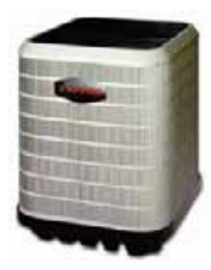
F Series Model