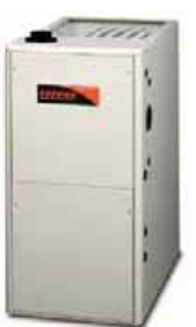
97+ AFUE iQ Drive Modulating Model

95.1 AFUE Two-Stage Upflow & Downflow Models