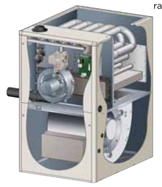
95.1% AFUE upflow/horizontal cutaway view shown

Since air is circulated at longer cycles more continuously, room temperatures are balanced and more comfortably mixed. Temperature swings are reduced to barely a couple of degrees and hot and cold spots are minimized. The variable motor will automatically maintain its programmed level of airflow. Better indoor air quality can be achieved quietly and inexpensively when the thermostat is set to run the fan in continuous mode. This will help reduce electrical consumption from 500 watts to 60 over a furnace without variable-speed.