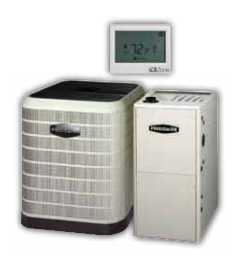
A Frigidaire iQ Drive® system is the most energy efficient, quietest system you can buy.