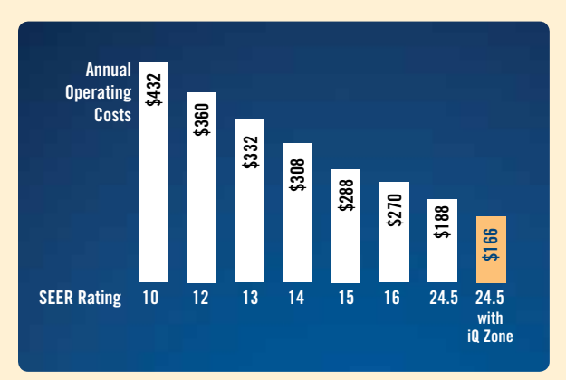
Annual costs based on 36,000 Btu unit, 1,500 cooling load hours, and .08/kwh. Actual costs may vary depending on climate conditions, energy rates and patterns of usage.

Your iQ Drive system is already the quietest on the market. So it's good to know that your zoning system will be just as quiet. The only way you'll know iQ Zone is operating is because every room will have the total comfort you prescribe.