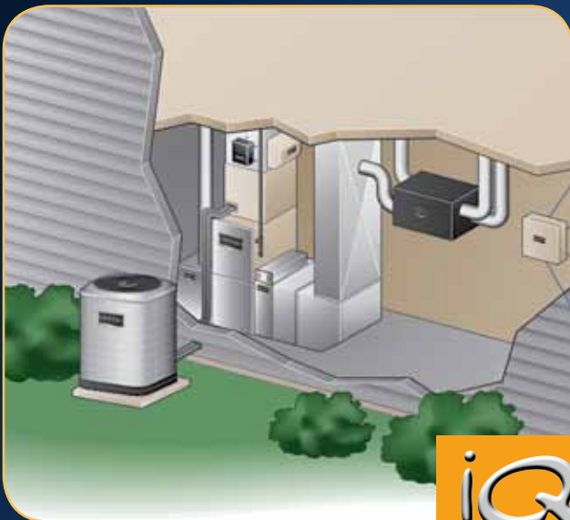
iQ Drive® Heat Pump System

iQ Drive heat pump systems consist of basically four parts: the outdoor heat pump, the indoor air handler or furnace with coil, an iQ Drive thermostat, and the air delivery system (ductwork).