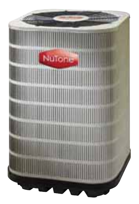
NuTone up to 16 SEER air conditioners and heat pumps utilize a variable-speed indoor unit.

A NuTone variable-speed system automatically maintains its programmed level of air flow regardless of dynamic changes in static pressure. Static pressure will change with a dirty air filter, zoning changes and obstructed supply registers as an example. Better indoor air quality is achieved quietly and inexpensively by setting the motor to run continuously at reduced airflow levels between cooling cycles. The NuTone variable-speed system also operates quieter than conventional motors, while reducing temperature swings, indoor moisture, and hot spots.