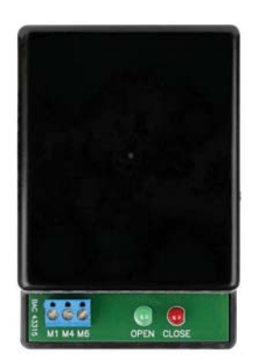
Model MDM Motor with Position LEDs.

The PCRDM is available in 5", 6", 7", 8", 9", 10", 12", 14", 16", 18" and 20" diameters.