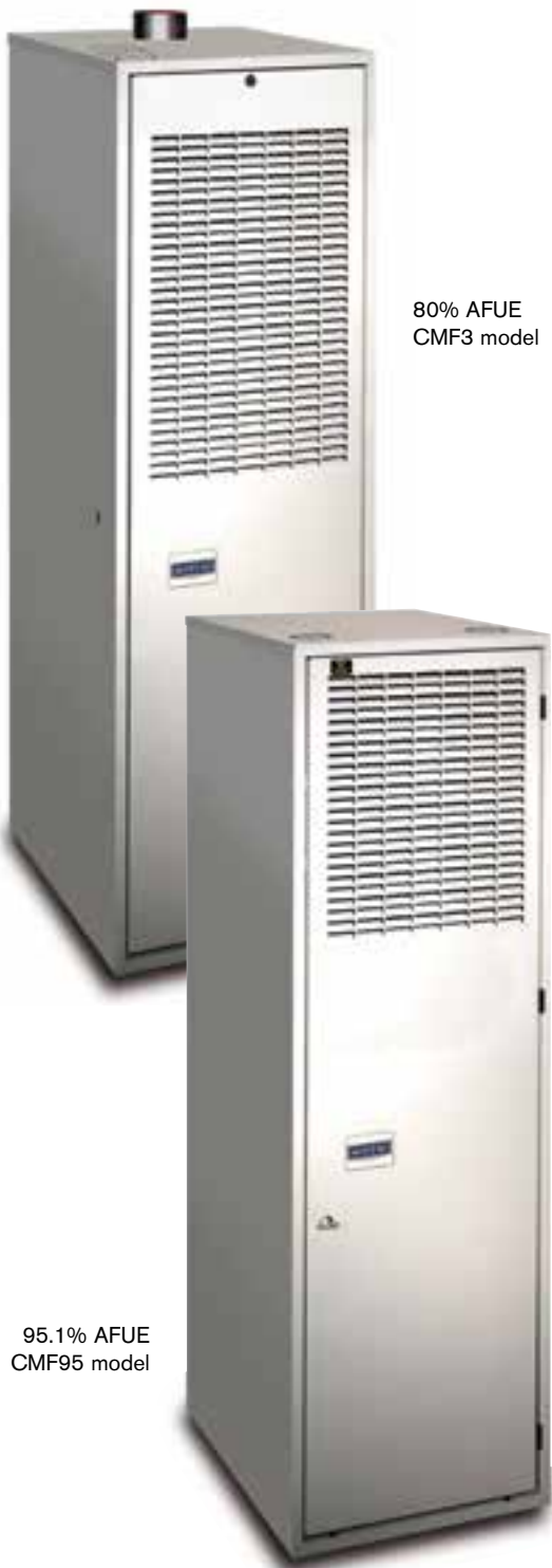
80% AFUE CMF3 model