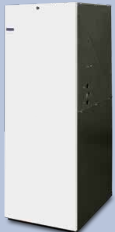
E5EU Upflow Electric Furnace