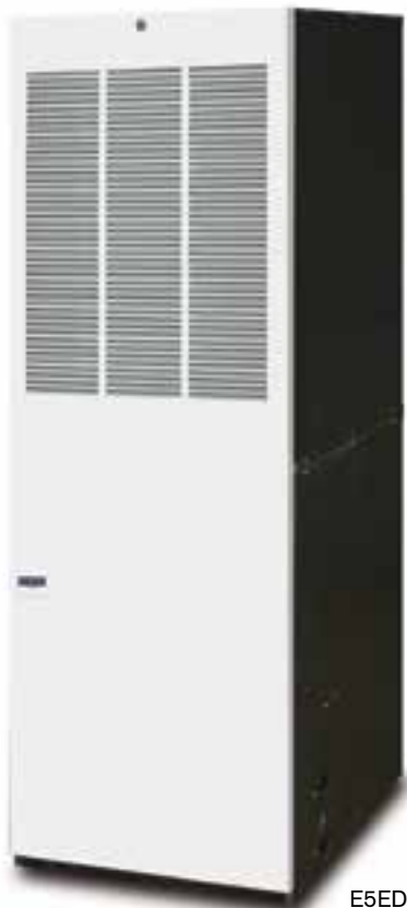
E5ED Downflow Electric Furnace