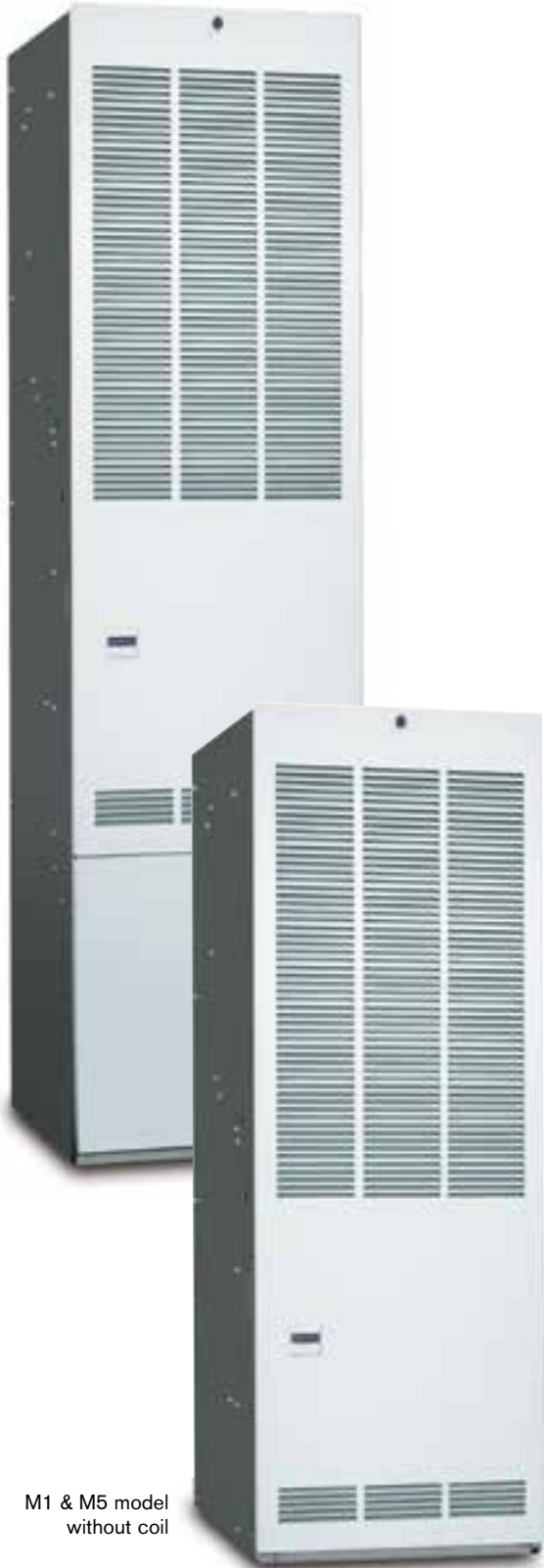
M1 & M5 model without coil

Below are key features and benefits of Maytag® Gas Gun, Hot Surface Ignition and Oil Gun furnaces: