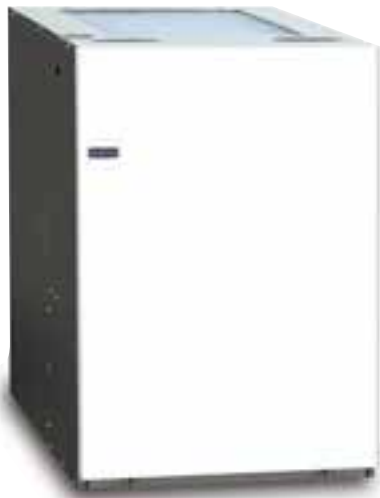
E4 Electric Furnace