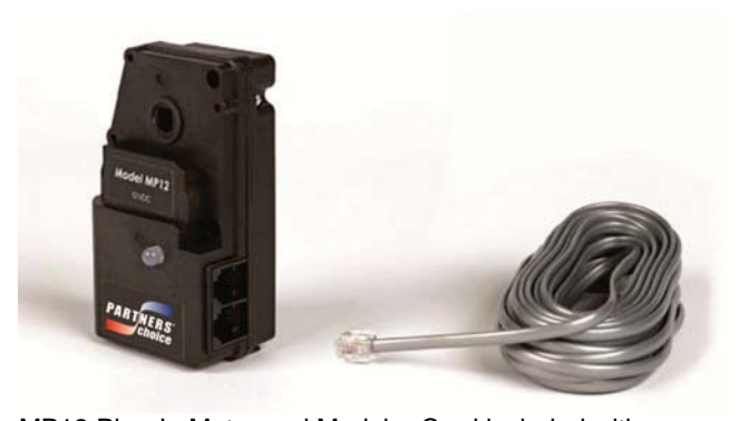
MP12 Plug-In Motor and Modular Cord included with damper.

The P suffix after the model PCZDS or PCZDB denotes that damper is operated by the exclusive Plug-In Damper Motor. The 12VDC motor, powers the damper both closed and open. The energy saving motor, Model MP12, draws less than 1VA for the few seconds it takes to operate. The motor features an internal switch that removes power to the motor when in the Open and Closed position providing extra long life. The MP12 motor has been life tested to over 1,000,000 cycles.