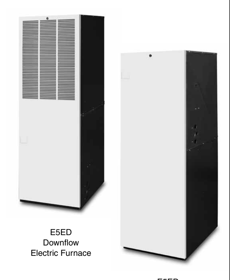
E5ED Upflow Electric Furnace

The E5ED/U Series furnace is designed for all sizes of manufactured and modular homes. These units incorporate reliability and low maintenance. Units may be installed free standing in a utility room or enclosed in an alcove or closet. E5ED/U Series furnaces are A/C ready, with multiple blower combinations for cooling requirements.