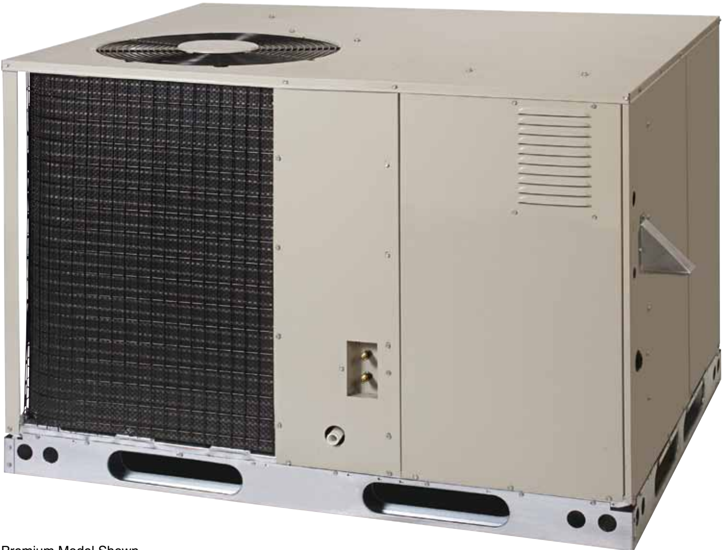
Premium Model Shown

Single Package Gas Heating / Electric Cooling (G)R6GD Series 13 SEER, Single Phase Models