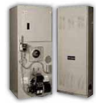
Downflow Horizontal with Vestibule Model