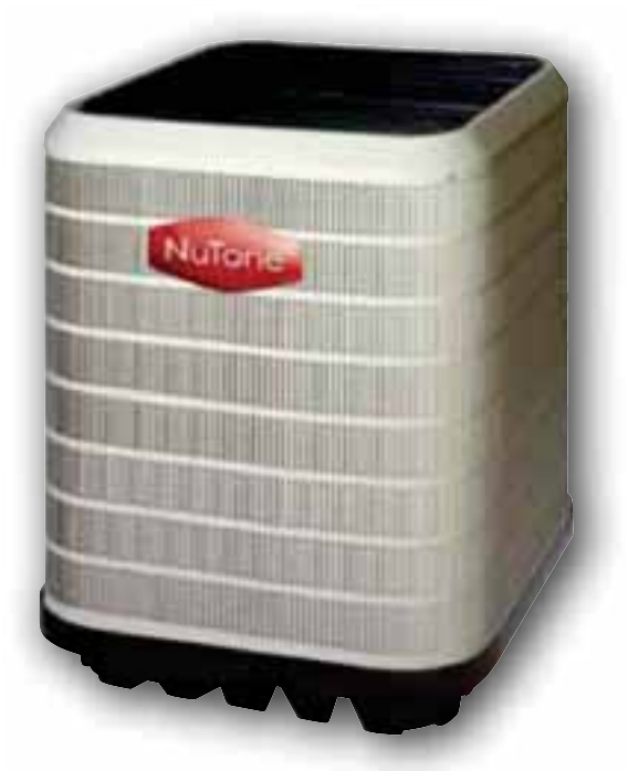
NuTone up to 16 SEER air conditioners and heat pumps utilize a variable-speed indoor unit.

A NuTone variable-speed system automatically maintains its programmed level of air flow regardless of dynamic changes in static pressure. Static pressure will change with a dirty air filter, zoning changes and obstructed supply registers as an example. Better indoor air quality is achieved quietly and inexpensively by setting the motor to run continuously at reduced airflow levels between cooling cycles. The NuTone variable-speed system also operates quieter than conventional motors, while reducing temperature swings, indoor moisture, and hot spots.