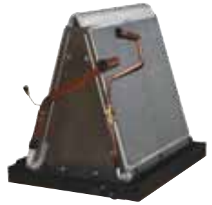
Uncased Indoor Coil

Split systems have two main components, the outdoor section (e.g. air conditioner or heat pump) and the indoor section (e.g. coil and furnace or air handler). These two sections work together to provide top performance, maximum efficiency and comfort.