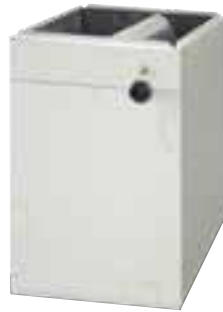
Cased Indoor Coil