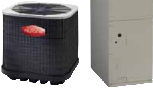
Up to 15 SEER Split System & Air Handler