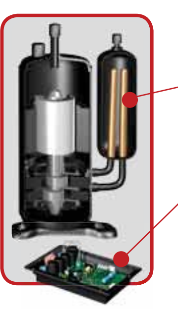
iQ Drive air conditioner cutaway view shown