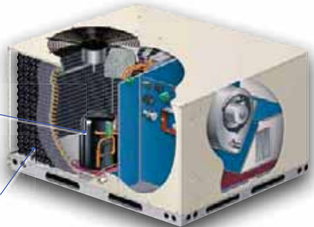
Model Q6SD 13 SEER, 7.7 HSPF Heat Pump

Mesh hail guard for enhanced coil protection