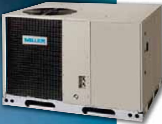
Models P6SD (13 SEER) & Q6SD (13 SEER, 7.7 HSPF)