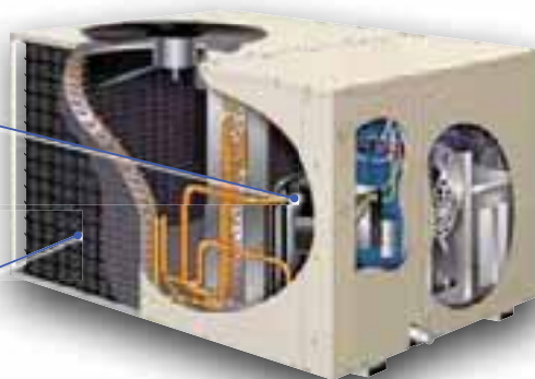
Model Q5RF 15 SEER, 8.0 HSPF Heat Pump