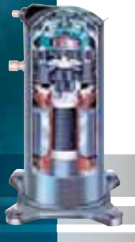
Copeland® scroll compressors provide long-lasting reliability.