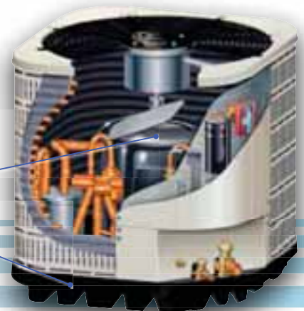
Model DT4BF Up to 16 SEER, up to 9.0 HSPF Heat Pump