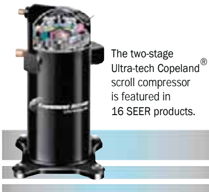
The two-stage Ultra-tech Copeland® scroll compressor is featured in 16 SEER products.