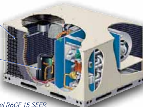
Model R6GF 15 SEER, 80% AFUE Gas Pack

2-stage scroll compressor for higher efficiency and lower sound levels