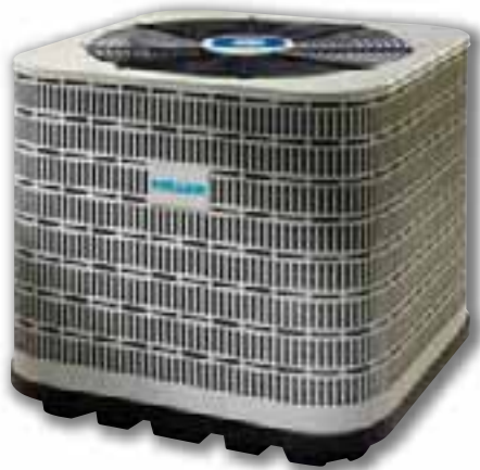
Models DS4BF (up to 16 SEER), DT4BF (up to 16 SEER, up to 9.0 HSPF), DS4BE (14 SEER) & DT4BE (14 SEER, up to 8.5 HSPF)

Miller extra high-efficiency split system air conditioners and heat pumps fit the bill for your heating and cooling needs.