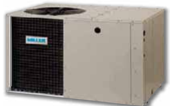
Models P7RD (13 SEER), Q7RD (13 SEER, 7.7 HSPF), P5RF (15 SEER) & Q5RF (15 SEER, 8.0 HSPF)