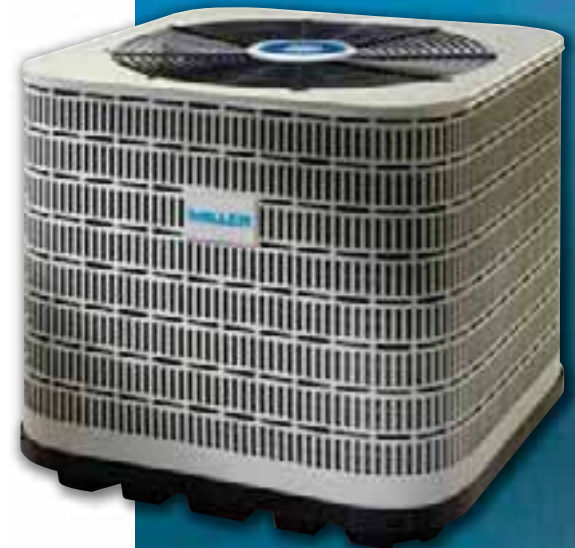
Models DS4(B,Q)D (13 SEER) & DT4(B,Q)D (13 SEER, up to 8.0 HSPF)

Miller coils are engineered to match our air conditioners and heat pumps, ensuring you get the full performance you're paying for. Our newest coils feature all-aluminum AnteaterMC Micro-Channel technology to completely eliminate formicary corrosion, the #1 cause of coil leaks.