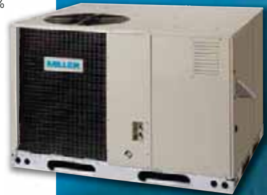
iHybrid™ Model DF6SF (15 SEER, 8.0 HSPF, 80% AFUE), R6GF (15 SEER, 80% AFUE) & R8GD (13 SEER, 80% AFUE)

A gas pack's efficiency is rated in both SEER and AFUE - Annual Fuel Utilization Efficiency. AFUE measures the unit's heating efficiency. The higher the AFUE rating the more energy efficient your system is and the lower your energy costs will be.