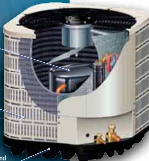
Model DS4BD Air Conditioner