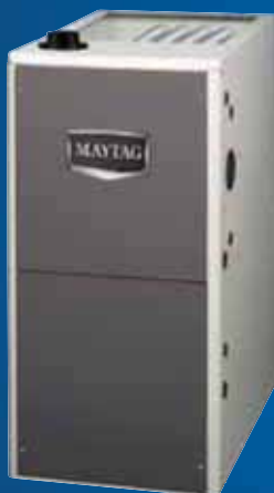
M120 Upflow/Horizontal & Downflow

2-Stage 80% AFUE Variable Speed (M1200 Only) & Fixed Speed Gas Furnaces