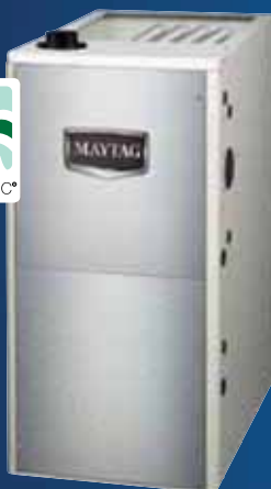
M1200 Upflow/Horizontal & Downflow