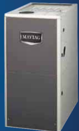
M120 Upflow/Horizontal & Downflow