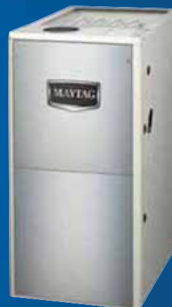
M1200 Upflow/Horizontal & Downflow

2-Stage 80% AFUE Variable Speed (M1200 Only) & Fixed Speed Gas Furnaces