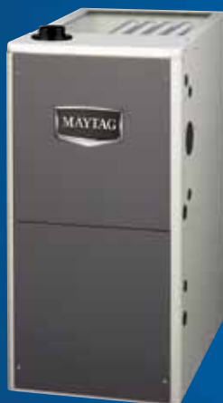
M120 Upflow/Horizontal & Downflow

2-Stage 80% AFUE Variable Speed (M1200 Only) & Fixed Speed Gas Furnaces