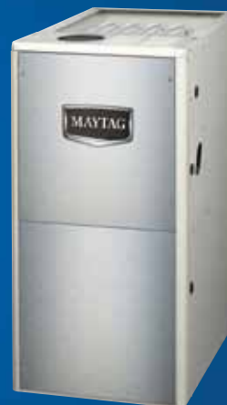
M1200 Upflow/Horizontal & Downflow

2-Stage 80% AFUE Variable Speed (M1200 Only) & Fixed Speed Gas Furnaces