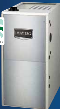
M1200 Upflow/Horizontal & Downflow