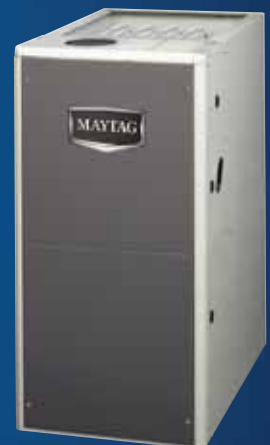
M120 Upflow/Horizontal & Downflow