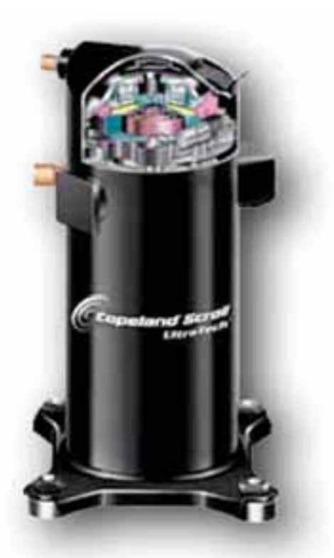
The Ultra-Tech Copeland Scroll<sup>®</sup> Compressor works with the variable-speed indoor section to decrease humidity levels and reduce hot and cold spots

Maytag<sup>*</sup> air conditioners and heat pumps include additional features for extra quiet-performance, such as swept-wing fan blades, sound reducing bases, and compressor blankets.