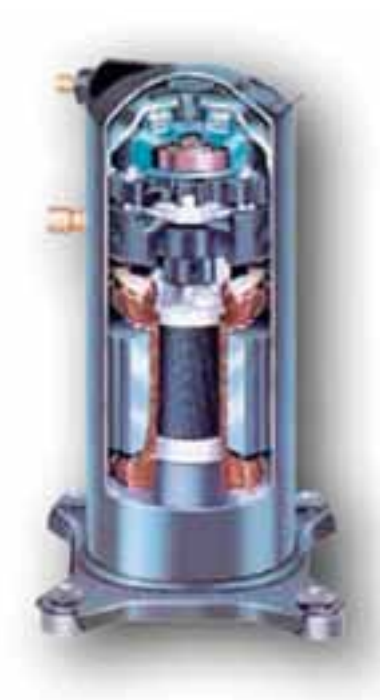
Copeland Scroll<sup>®</sup> Compressors have fewer working parts than reciprocating piston compressors for quieter operation, longer service life and reliability.

The high-efficiency condenser motor and fan blades provide quiet operation and low vibration. Your packaged unit is only one part of the comfort system that affects your air quality and energy savings. Maytag offers a complete line of system components to improve indoor air quality and help ensure the performance of your comfort system.